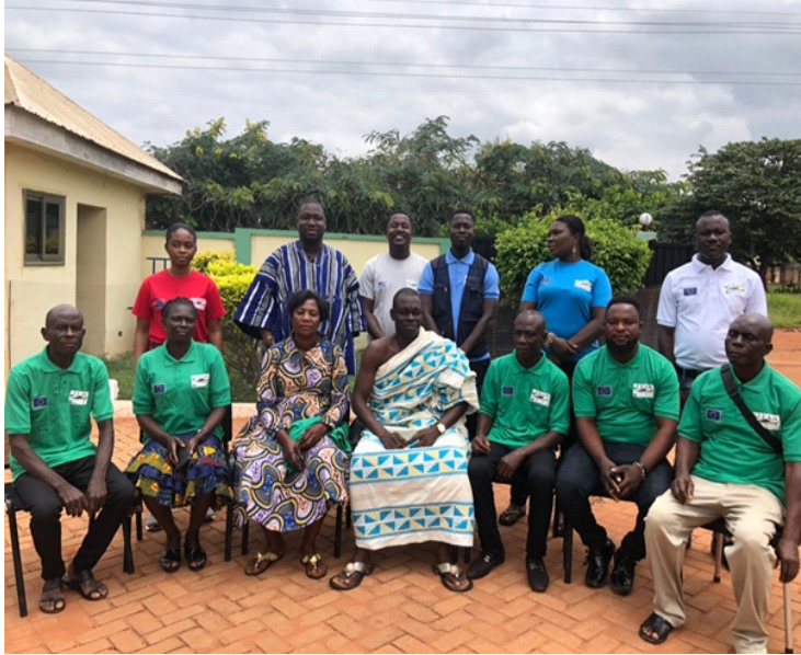
© ECG Elected Executives of Nkoranza 'Landscape Management Board' (LMB)

In order to mitigate the effects of climate change, it is important to restore and protect the landscape's original vegetation and to encourage sustainable land use.