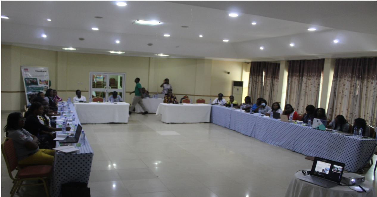
Cross-section of women in Forestry at the training workshop in Kumasi