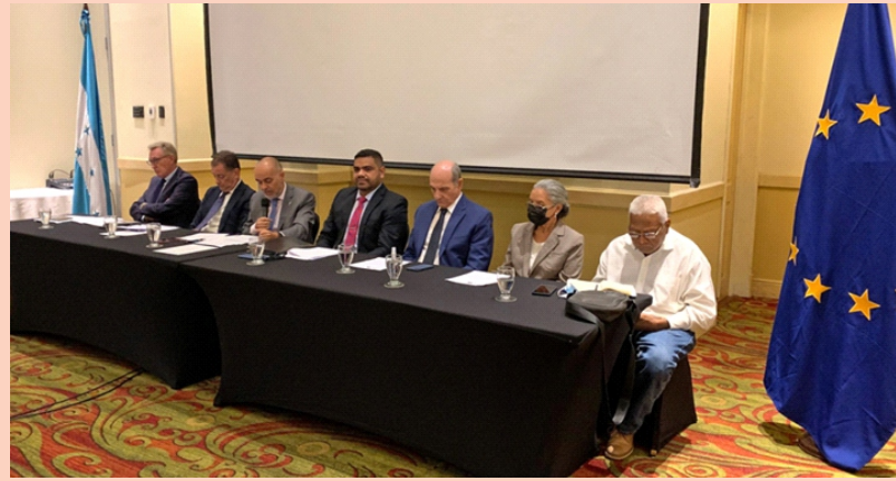
The first CCA meeting marked the official start of the implementation of the VPA between Honduras and the European Union

The CCA oversees the VPA and is co-chaired by the National Institute for Forest Conservation and Development, Protected Areas and Wildlife and the European Union. The CCA includes the participation of various Government ministries and